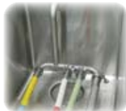
Clean interior and exterior of hoses