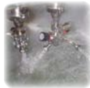
Clean diaphragm valves automatically